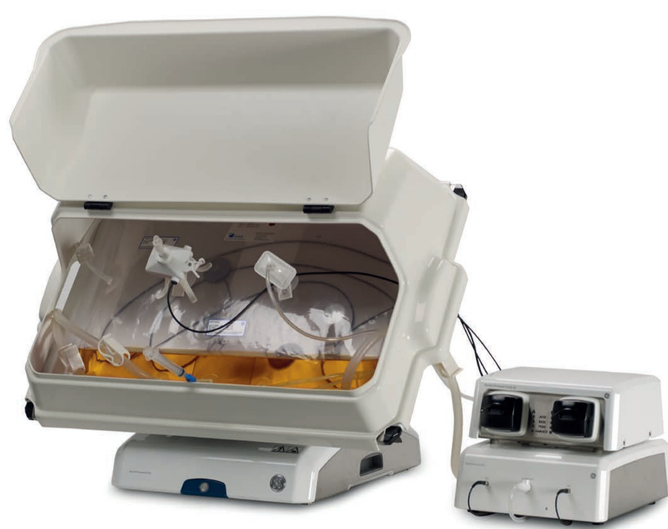
Fig 1. ReadyToProcess WAVE 25 perfusion bioreactor system.

The medium and feed combinations selected from the batch shake flask experiments were used in a steady state perfusion culture in ReadyToProcess WAVE™ 25 (Fig 1) or stirred tank bioreactor (STR)/ATF2 perfusion bioreactor systems. Under all conditions, a perfusion rate of < 1.5 volume per volume per day (VVD) was used. Experimental conditions are listed in Table 2.